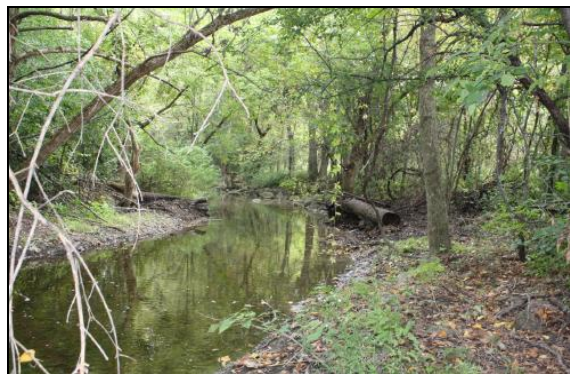
Restored creek after clean-up effort