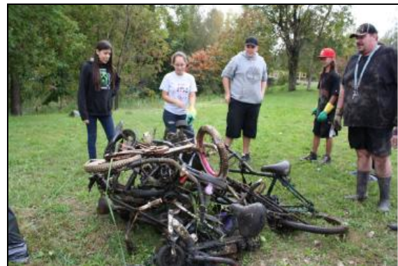
Volunteers posing behind the pile of bikes pulled out of the Little Suzanne River.