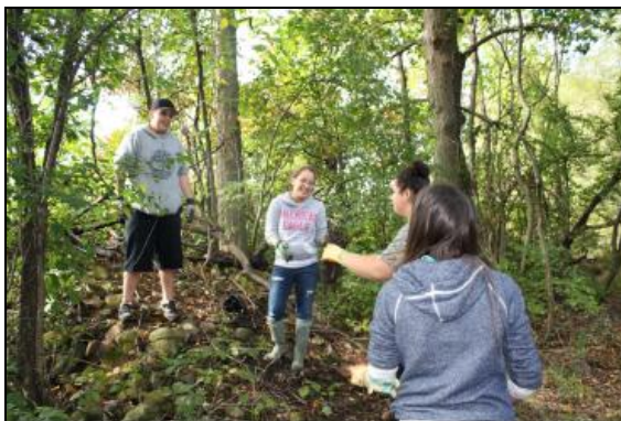
Survival School students passing debris from the creek. Sticks and mud were placed beyond the top of the bank to prevent it from being carried back into the creek during high spring flows.